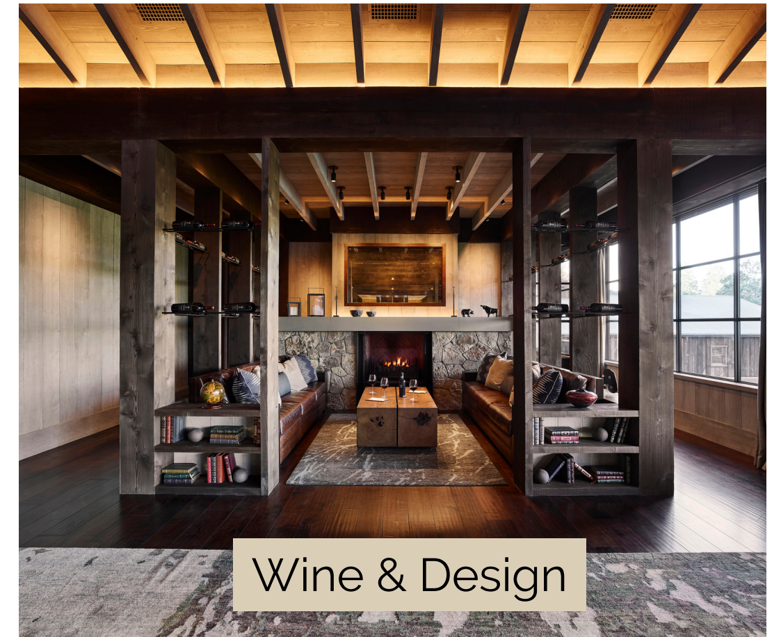
Wine & Design